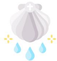
Baptism/ Profession of Faith

Come explore the richness of the Catholic spiritual life by being part of the OCIA journey. The process of becoming part of the Roman Catholic Church is known as the Order of Christian Initiation of Adults (OCIA) . Adults seeking to become Catholics receive weekly support, teaching and assistance at St Jerome from a team of wonderful catechists