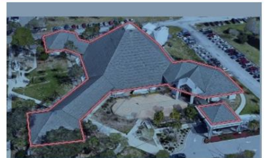
Raise the Roof: A solid, lasting future

CONGRATULATIONS! We have reached our May Raise the Roof Matching Goal! Every week we get closer to having the funds to replace the roof. Thank you for your generosity.